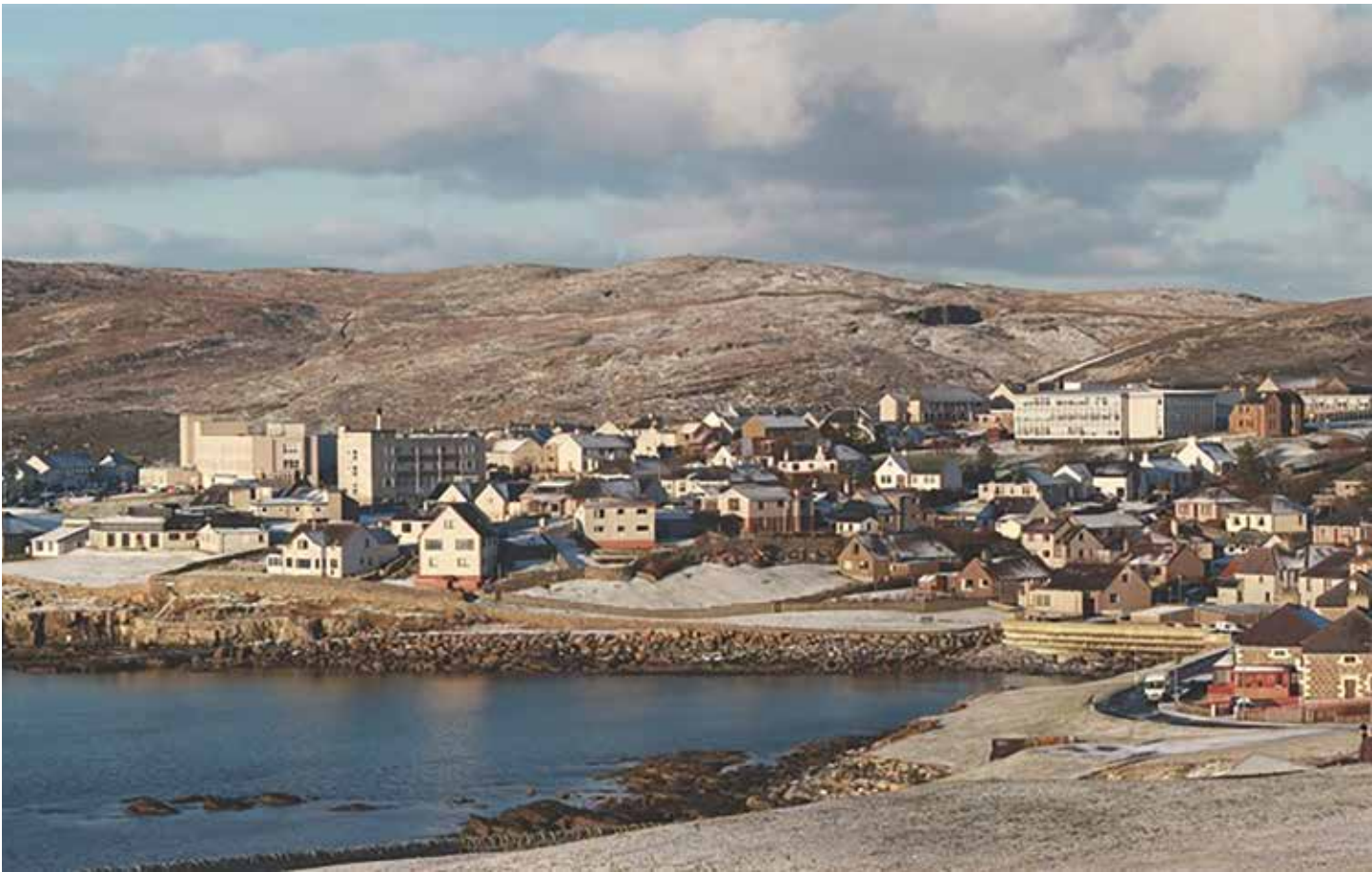
Lerwick, Shetland