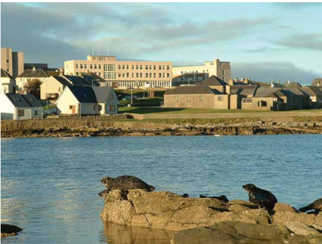
Gilbert Bain Hospital